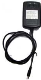
12V power adapter