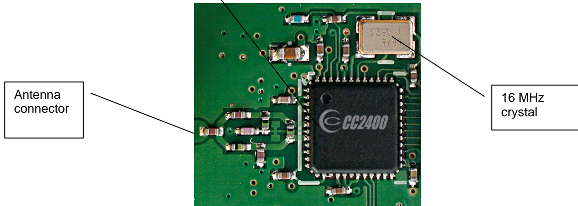
Figure 1: CC2400EM Evaluation Module