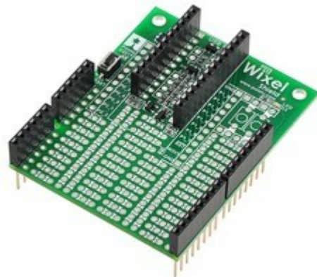
Wixel shield for Arduino (fully assembled).